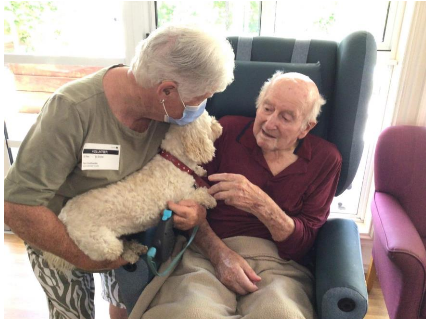
Above: Wally makes a friend