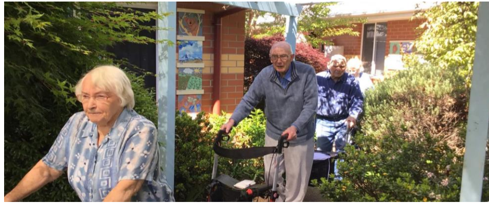
Above: Morning walk in the sensory garden Below: June busy at Knit & Natter