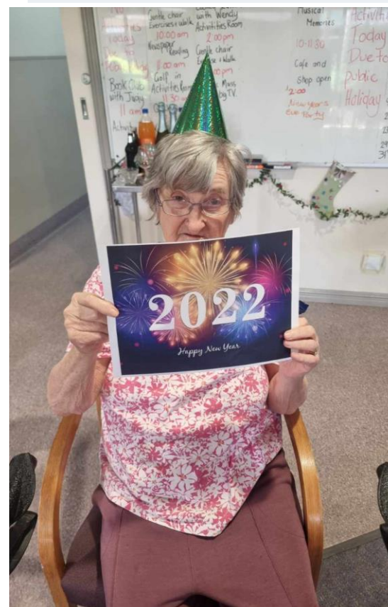
Happy New Year from all at Yackandandah Health