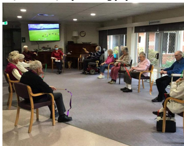
Gentle Chair Exercises are on offer most mornings