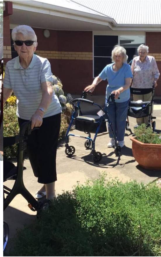
Above: The walking group, enjoying the garden