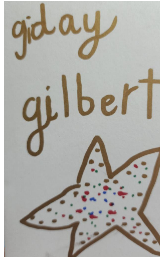
The Yackandandah cub scouts made personalised cards for every resident to cheer us up – how thoughtful