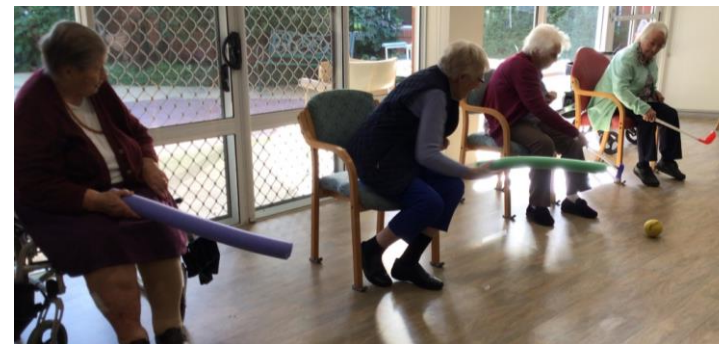
A game of Chair Hockey a bit can be rough