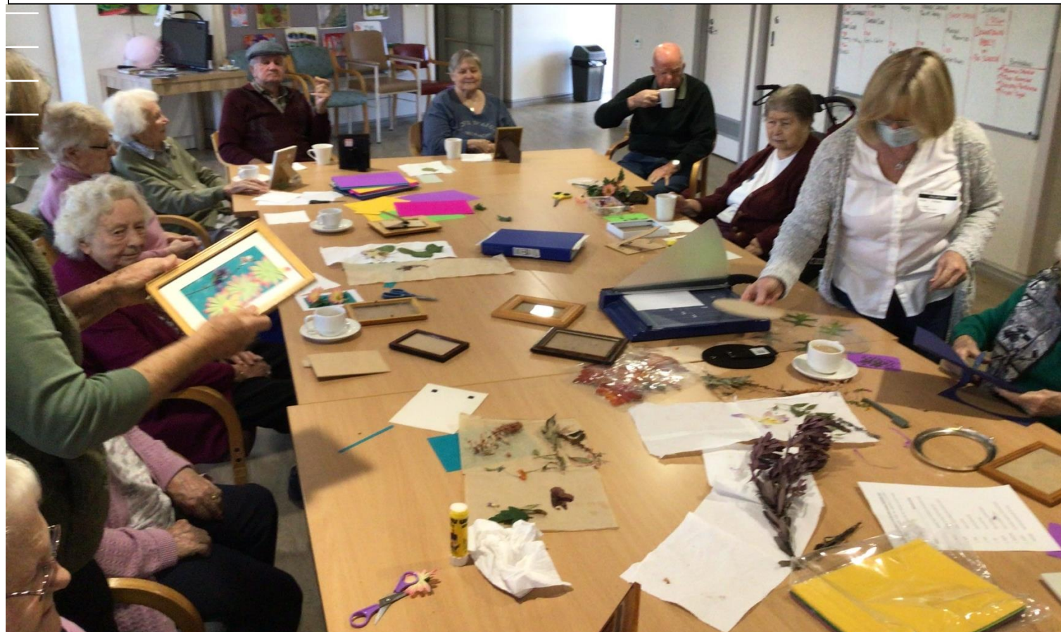
The garden Club craft morning, dried flower frames