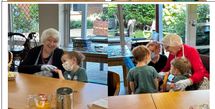
INTERGENERATIONAL PROGRAM Little Yacks joined Big Yacks Cooking up a storm Lemon Polenta Biscuits and Blueberry Muffins and they all went down a treat A fantastic morning was had by all