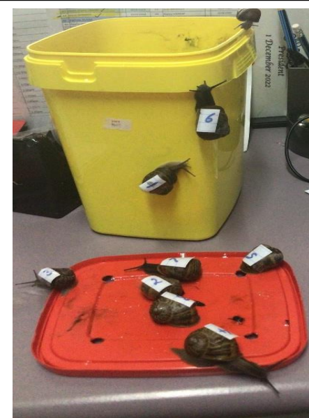
Snails were a little slower off the mark.