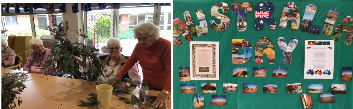
Arts and Crafts and Cooking the obligatory Lamingtons– All the preparations for Australia Day