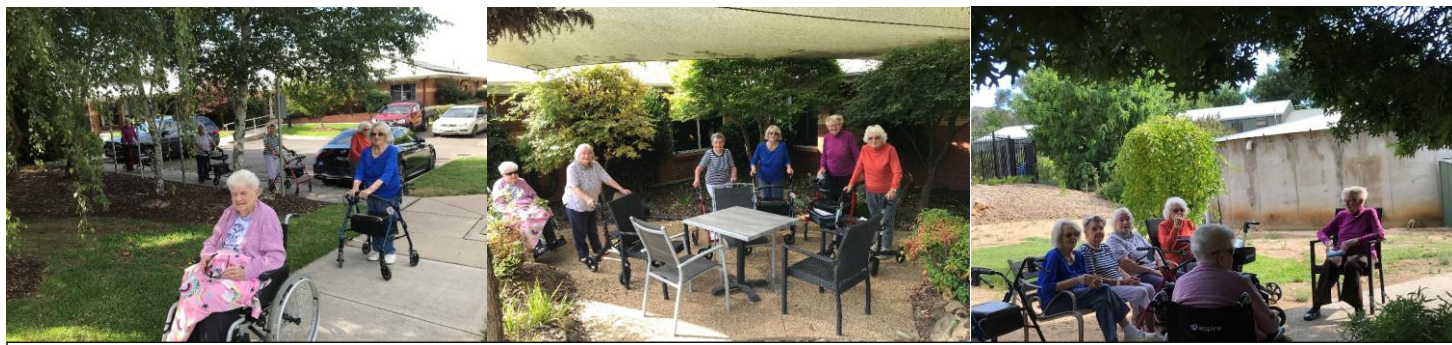
Residents enjoying their daily walk around the gardens followed by a chat under the OAK tree.