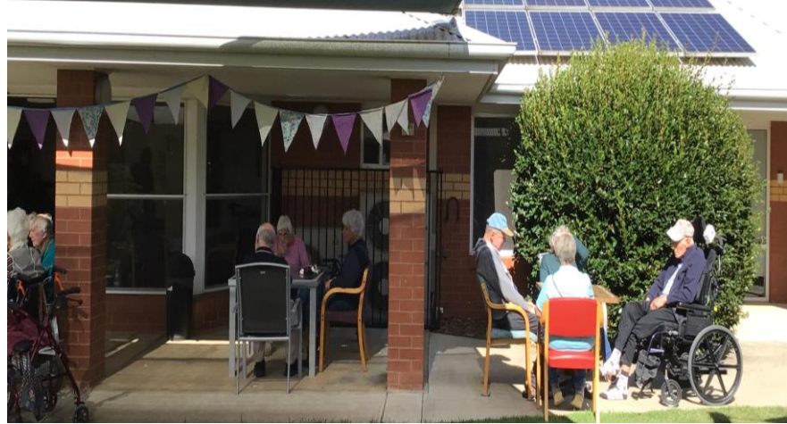
Some residents and families enjoying the beautiful autumn sunshine over coffee and scones at our Friday morning coffee shop.

Don't forget we are open every Friday including Good Friday for you to come and enjoy.