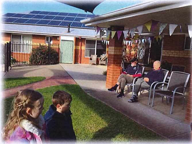
A surprise visit from Little Yacks on Thursday