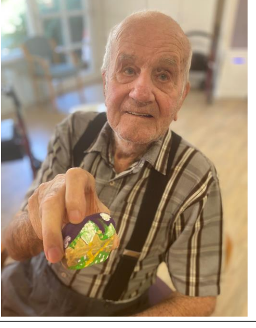
The Garden Club joined our residents in some Rock Painting on Tuesday. The Tuesday Walk & Talk group enjoying the outdoor sensory garden. This group loves to meet up for their regular Tuesday chat session.