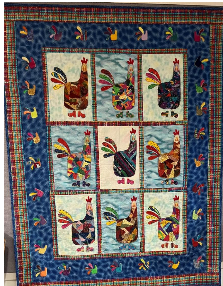
Above – Barb Clark made this quilt in 2003 it is called 'CRAZY CHOOKS IN GUMBOOTS' And here she is cooking up a storm in Wednesday's cooking program.