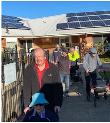
Left: Residents doing their daily walk and getting a daily dose of vitamin D from the sunshine.